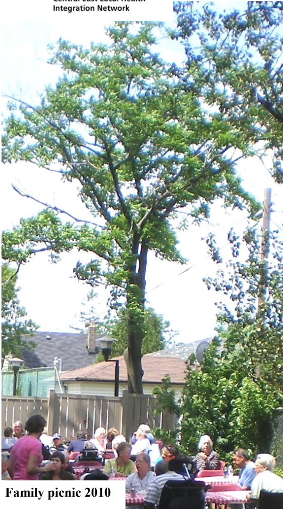
Family picnic 2010