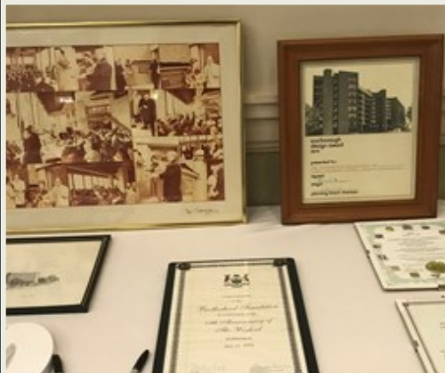
Wexford memorabilia showcasing the history of the Wexford.