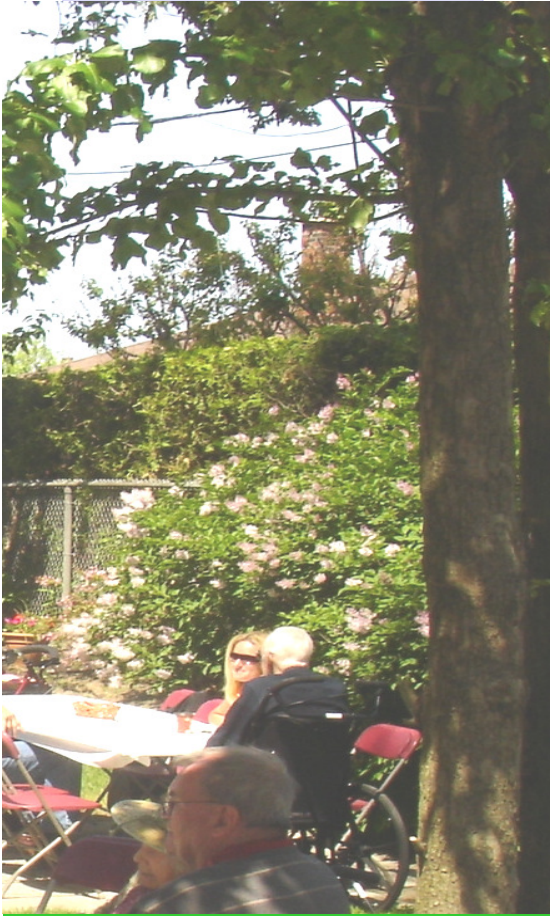
Resident Family Picnic in our own backyard ..... pg5