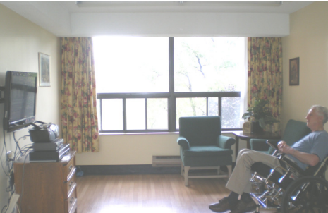
Alan Burchell, 4th floor resident enjoying The new renovated 4th floor lounge